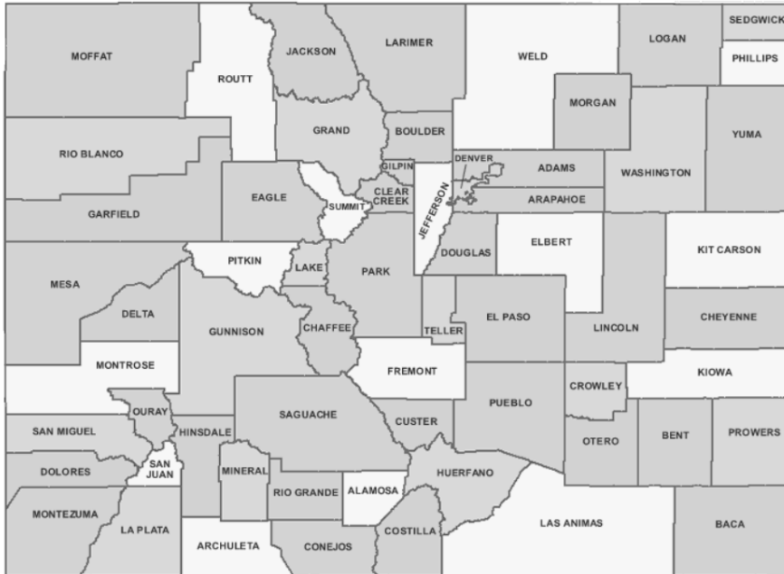
Colorado's 64 Counties (FamilySearch Research Wiki)